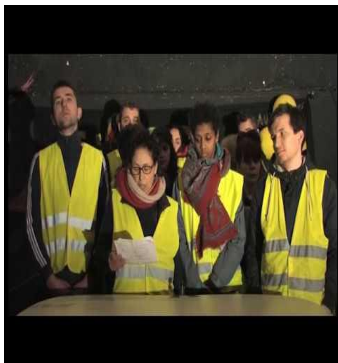
VIDEO: "Yellow Vests respond to the call from Commercy" _____

Moreover, the prevailing democratism in these "assemblies" means that everyone can express themselves "freely", strikers as well as strike-breakers, radicals as well as moderated: rather than "liberating the speech" (and it is obvious here that we don't claim "freedom of speech" that our enemy the democracy is so much praising in order to better make us talk, to silence us), they often also liberate the chitchat at the expense of direct action. What's the point of voting for very "radical" great resolutions if the proletariat does not break the forces of inertia that block the extension and development of the struggle!?