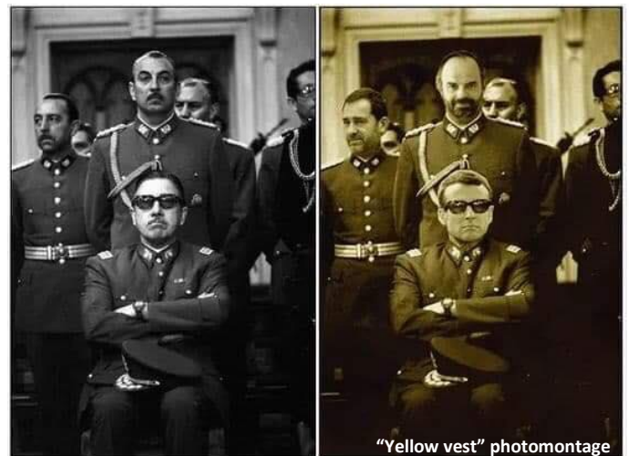
"Yellow vest" photomontage

We see the press, the political class and the bosses huffing and puffing to divide the movement. They shout "thugs", "violence", and "terrorists". That's all they ever talk about in order to dissuade us from struggling, and one of the great thing is the fact that their trick doesn't work. However, we have to say that what we have been going through for the past two months was no walk in the park. The commitment is demanding, the vultures are lying in wait, our end-of-month difficulties are still there and the horizon we are promised looks like an apocalyptic film. We refuse this future and that's why we are tinkering with means to put an end to all this. Some of them are proposed in the following pages. "Jaune", the newspaper to win.