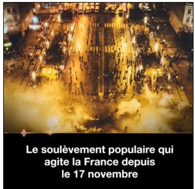
VIDEO: "Act IV – We take Paris!"

https://rouendanslarue.net/gilets-jaunes-fin-de-premiere-manche/rouendanslarue@riseup.net